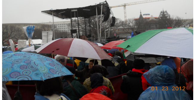
Though not broadcast on networks, hundreds of thousands gathered to March for Life in