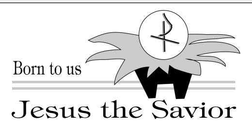
FOURTH SUNDAY OF ADVENT

Tabernacle Flower Intention/Memorials are available for the following dates: January 12, 19; February 2, 9, 16. The donation is $25. Please call the parish office.