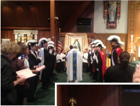
Our First Holy Communion children participated in the procession along with the Altar & Rosary

Holy Family Parish honored our Blessed Mother during the May Crowning and Procession at the 9 a.m. Mass on Sunday May 5 th .