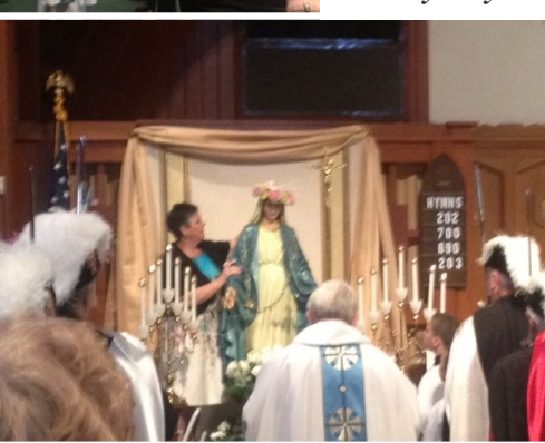
Our First Holy Communion children participated in the procession along with the Altar & Rosary

Holy Family Parish honored our Blessed Mother during the May Crowning and Procession at the 9 a.m. Mass on Sunday May 5<sup>th</sup>.