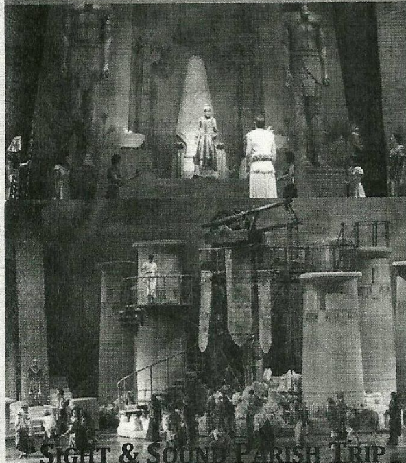
SIGHT & SOUND PARISH TRIP