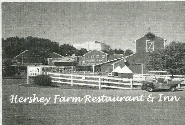
Hershey Farm Restaurant & Inn