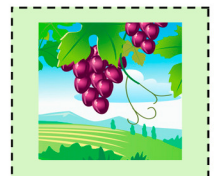
farmer earth grapes love vineyard Jesus