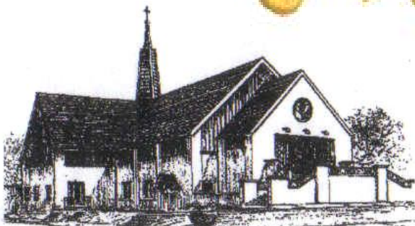
Holy Family Parish Hazlet/Union Beach